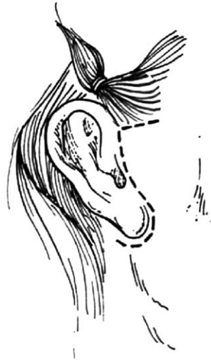
Fig. 5. 5-STAR incision. Note incision inside sideburn hairline, extending preauricularly (either pretragal or posttragal) and for a short distance postauricularly (short scar transauricular rhytidectomy).

jowels as indicated through a submental incision the midline platysma is isolated, and a wide strip wedge platysmaectomy is performed to shorten redundant platysma muscle and deepen the cervicomental angle. When fat excision is indicated, the exposed fat deep to the platysma muscle is excised under direct vision. The medial (anterior) borders of the platysma muscle are then identified, and a back cut is performed at the level of the hyoid. The medial borders are then sutured in the midline with a nonabsorbable suture. This medial vector pull on the platysma is important for defining the cervicomental angle and for the redraping of excess skin into the submental hollow that occurs with the short scar face-lift. It is not necessary or desirable to have excess lateral vector pull on the platysma.