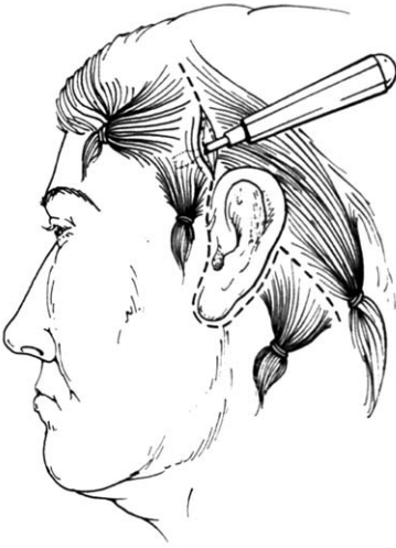
Fig. 3. Traditional open face-lift approach, which allows wider access (ie, the temporalis muscle).

region, either pre- or posttragal; curves around the ear lobe posteriorly up to the postauricular notch; and ends in the sulcus approximately 2 to 3 cm from the lobule. It spares incisions in the temporal and mastoid areas (see Fig. 5).