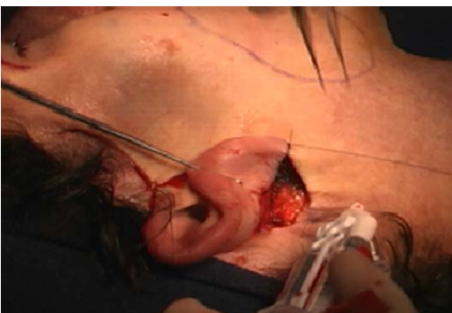
Fig. 7. Intraoperative fibrin sealant application with dual-injection device before closing. Key sutures at the helical rim and tragus. The preauricular suture begins at the lobule and is then used in a running fashion up to the helical rim. Note the redundant postauricular distal skin that redrapes and flattens. This is aided by the fibrin sealant and “walking out” the excess tissue while closing with staples.

Next, the face and neck skin is undermined widely beyond the sternocleidomastoid muscle and then across the cheek and along the jawl, freeing any retaining ligaments. The superficial musculoaponeurotic system (SMAS) in the face is addressed with a SMAS resection, SMAS plication, or anterior imbrication. The skin flaps on one side are redraped obliquely and vertically, so that the mandible no longer represents a border to the advancement of the neck skin (Fig. 6). This is done while adjusting the flap position to minimize bunching at the proximal (anterior end of sideburn) and distal (posterior lobule) incisions. The addition of the Tisseel glue provides a