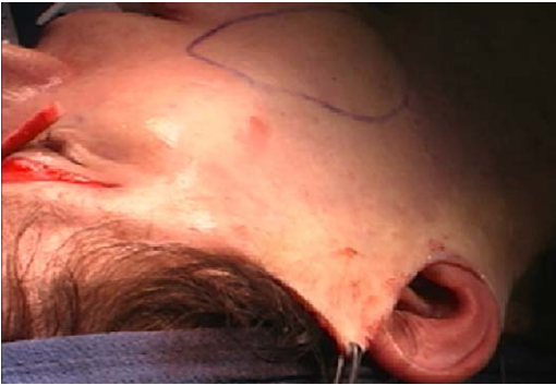
Fig. 6. Flap redraping in an oblique and vertical vector before sealant application. Note the circle depicting the area of the jawl that was liposuctioned.

futile exercise that does not benefit poor-quality skin [17].