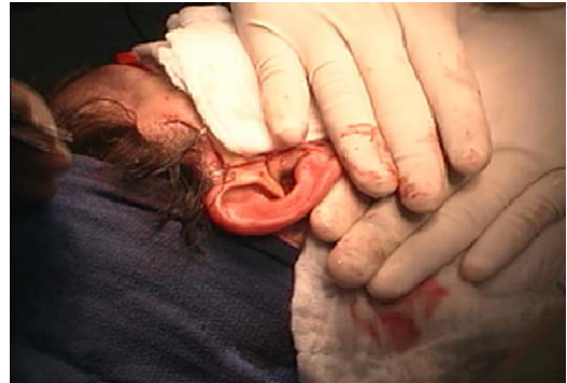
Fig. 8. Fibrin sealant is applied within 1 minute and manual pressure for 3 minutes after application. During this time, wounds are closed.

significant draping advantage in the neck and postauricular region.