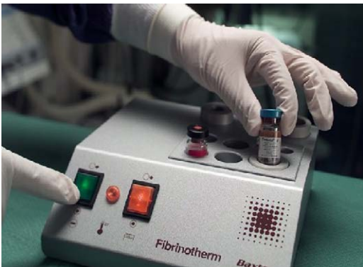
Fig. 1. Heating device for sealant.

Tisseel fibrin sealant firmly adheres to connective tissue and has elastic properties that enable it to contour over pulsating areas. It is ideal for use over small areas of oozing but is not indicated for arterial