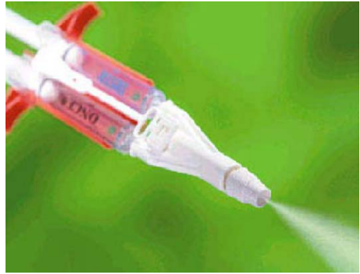
Fig. 2. Dual-projection delivery aerosolizing syringes.

bleeding. The tissue glue is indicated for sealing oozing on large raw surfaces [13]. It has not been associated with any caustic tissue damage when it is applied locally and is completely absorbed within 1 to 2 weeks [14]. Older fibrin sealants had higher sodium content that rendered the clots formed transparent, and more brittle. The low sodium content of newer formulations enables the thrombin to convert the fibrinogen to fibrin on the tissue surface. This creates a fibrin matrix with structured strands that are more effectively cross-linked by factor XIIIa and that form a stronger visible clot. Once the clot is formed, the bovine aprotinin component, the antifibrinolytic agent, reduces the rate of clot lysis by endogenous plasmin [15]. By sealing the raw surfaces of capillaries, postoperative bleeding, edema, pain, and the potential for hematoma formation are minimized.